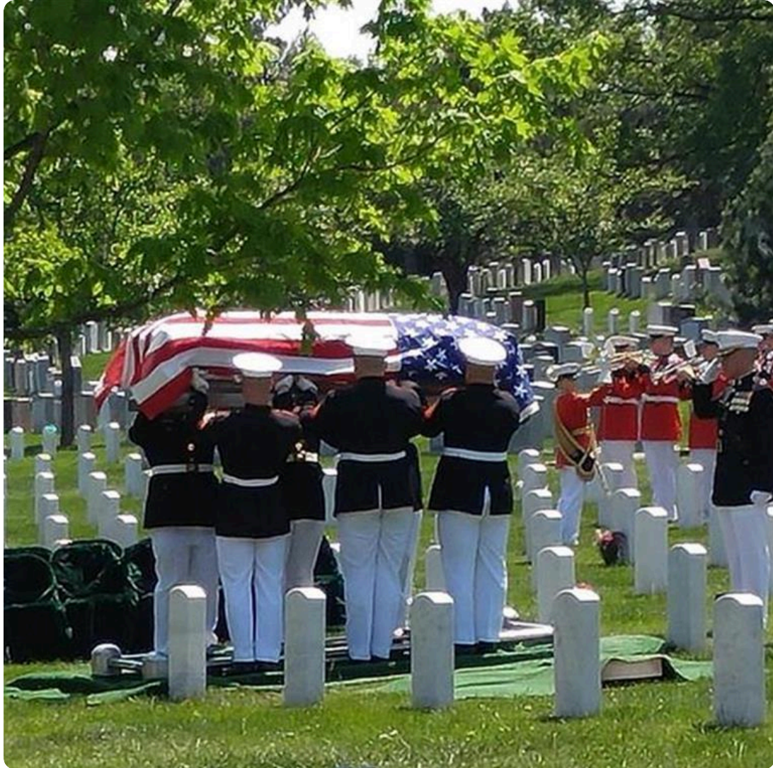
USMC Salute for Dad